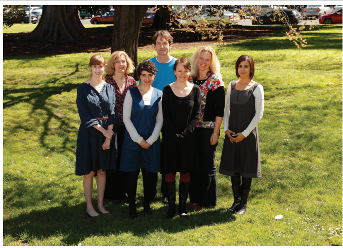
The Mental Health Research Team at The Centre for Health Policy, Programs and Economics